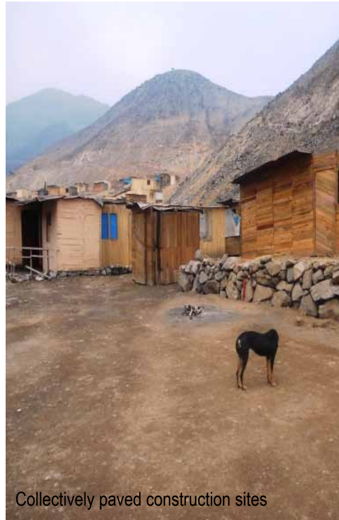
Collectively paved construction sites

Rubén says it has not been easy for families to accept the collective purchase via their organization. "People are very distrustful, they have been cheated too often and it is a great achievement that there is trust in the organization. The joint purchase all has allowed to lower the cost. We hope to achieve the same thing with the purchase of construction mate