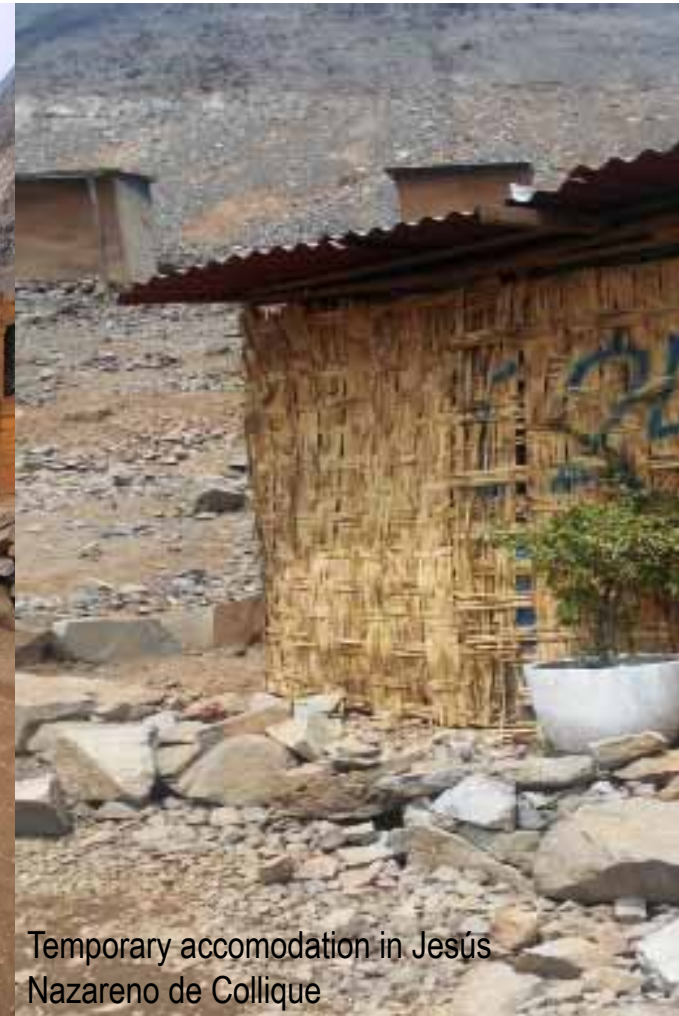
Temporary accomodation in Jesús Nazareno de Collique

The organization of the MST now includes around 4,000 families. 250 Families were involved in the first housing program. The regulation, unanimously approved, requires approval by the assembly in the future if someone wants to transfer their lot and housing to third parties. In this way, it is hoped to maintain the social cohesion that characterizes the collective at this time. Shortly, the MST will start with the second territorial program, located in the sector of Carabayllo, with a capacity for five thousand families.