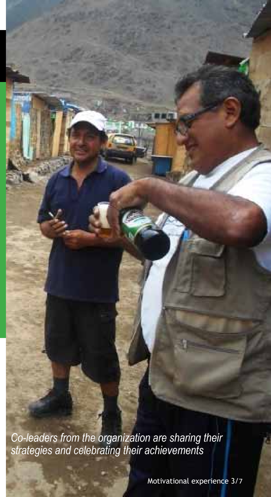
Co-leaders from the organization are sharing their strategies and celebrating their achievements