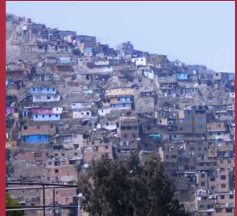
The people who live on slopes are particularly vulnerable to disasters.