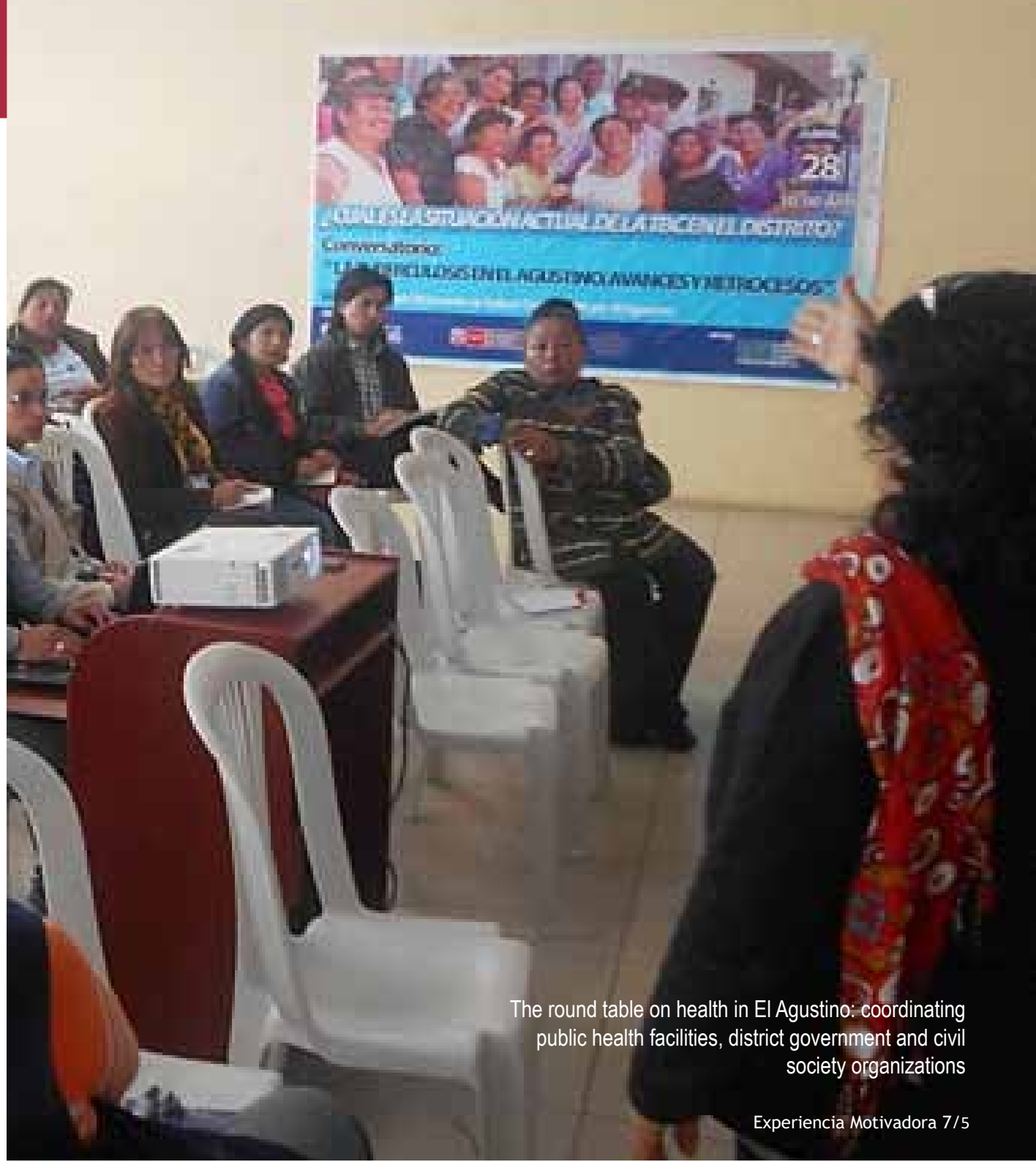
The round table on health in El Agustino: coordinating public health facilities, district government and civil society organizations

A year ago, the network of women, together with the central of communal banks and the organization of popular kitchens formed the collective Groots in Peru; Groots is an international move-